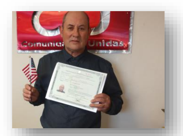
DOJ-Accredited representation for Citizenship, family petitions, DACA renewals.