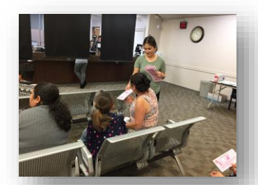
Education about financial system, connection with resources, financial coaches.